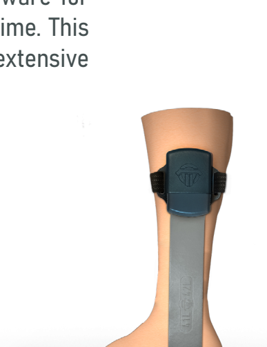
Attention! We are constantly improving our product, so the current status of our components may differ from the illustrations at any time!